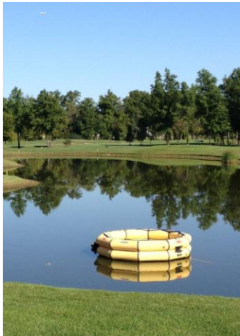
A Winslow liferaft stands by to assist golfers who miss the green at the 18th hole water hazard

On September 12th, GWBAA held its 8th Annual Golf Tournament. The weather was a perfect warm fall day with a bright sun over the 1757 Golf Club. 70 golfers enjoyed a great day on the links in support of GWBAA and the Aero Club Foundation of Washington. They also raised $1,500 for the Corporate Angel Network through mulligans.